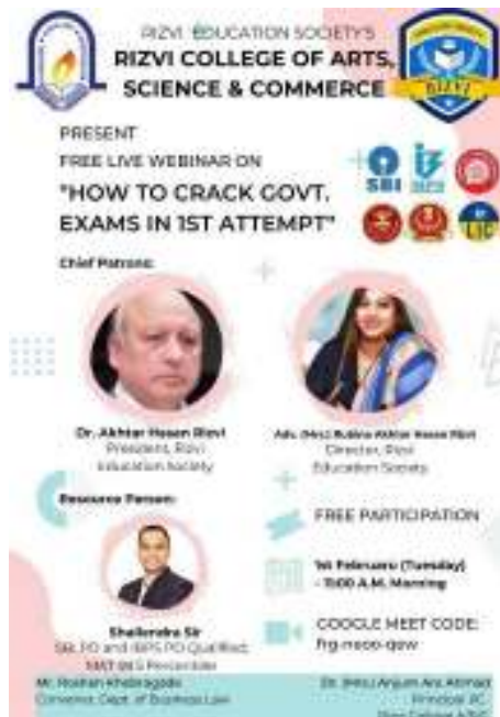
Online Seminar on "Government Job Exams" was conducted on 1st February 2022 at 11 am, by Department of Business Law and IQAC. 42 students were present for the same.